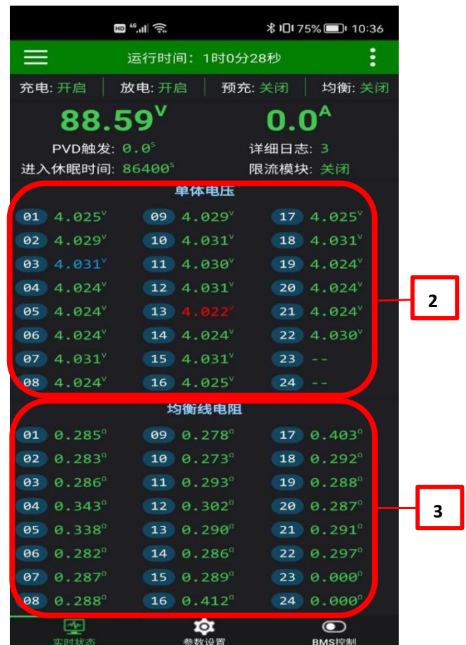
图 7 实时状态显示