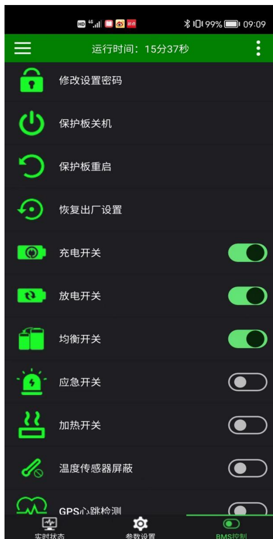
图 9 BMS 控制页面

The BMS control page is shown in Figure 9. Through the BMS control, the protection board can be switched on and off for charging, discharging and balancing functions and restore factory Settings.