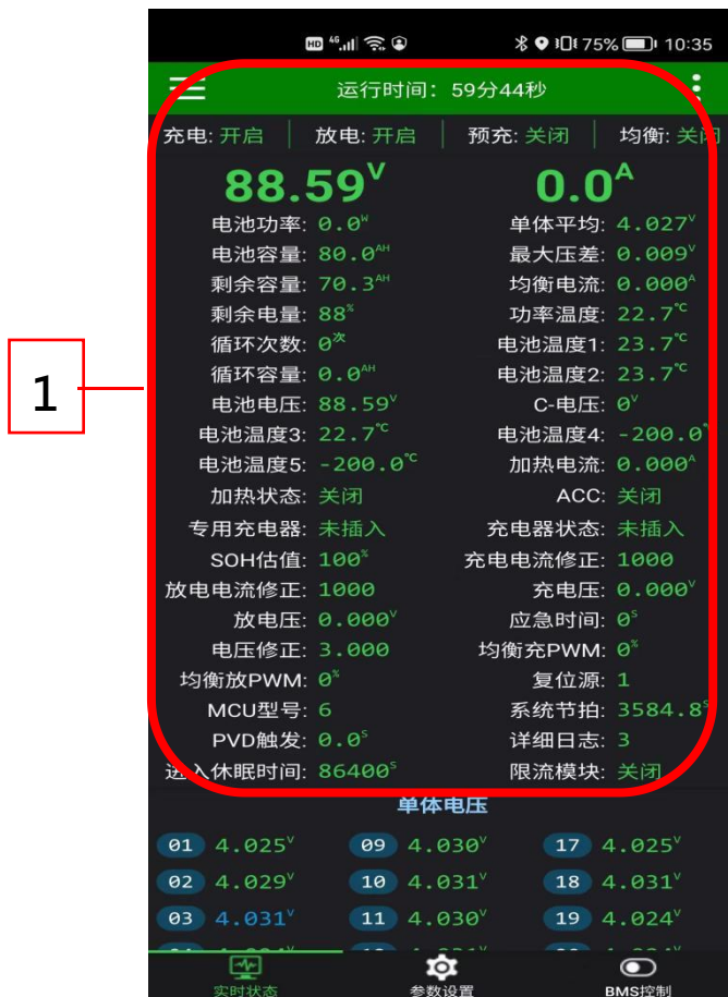
图 6 实时状态显示

The real-time status interface is shown in Figure 6、7.