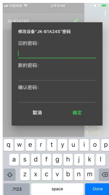
图 5 密码修改