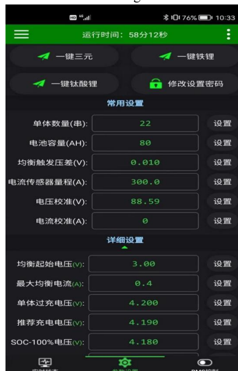
图 8 参数设置页面显示

The parameter setting interface is shown in Figure 8.