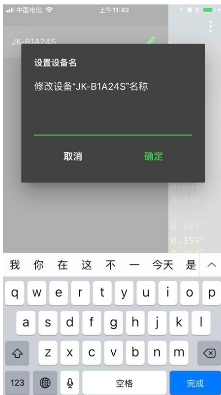
图 4 名称修改

The password modification interface is shown in Figure 5. To change the device password, you must first enter the old password of the device. Only when the current password is correct can you enter the option for entering the new password. After entering the new password twice, click "OK" to complete the device password modification.